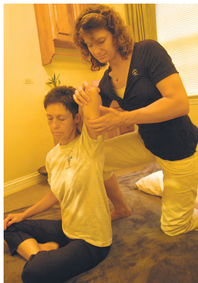
A Thai massage, offered by Tranquility Skin & Body Care Center includes yoga stretching and acupressure.

You might like the fact that Thai Massage, a technique in which the therapist uses his or her body to move you into a series of poses, is done fully clothed. You'll undergo muscle compression, joint mobilization and acupressure and feel longer, leaner and more flexible.